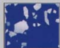
Dark Blue #320