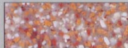
Gold and Red