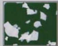
Olive Green #460

MS-1600 is a two-component, flexible, self-leveling epoxy membrane designed to level and protect uneven surfaces. Used in conjunction with CF-100. Offers sound deadening, comfort of foot due to resiliency and protects substrate from moisture intrusion.