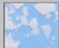
Azure Blue #300