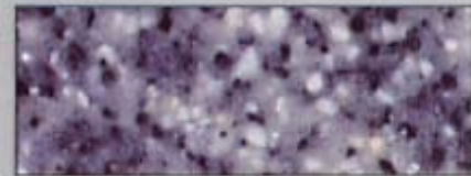
Salt and Pepper